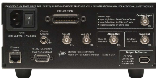
SR470 Rear Panel

The SR470 and SR474 Laser Shutter systems from SRS offer performance and reliability not found in other systems. For more details call us at 408-744-9040.