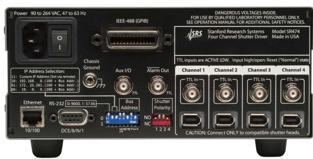
SR474 Rear Panel